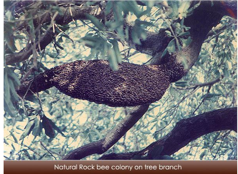
Natural Rock bee colony on tree branch